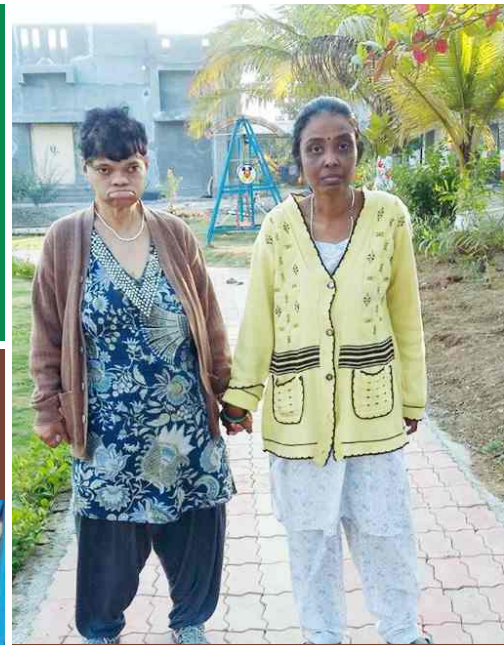
Residents Walking on Garden Track Sponsored by Saraswat Foundation