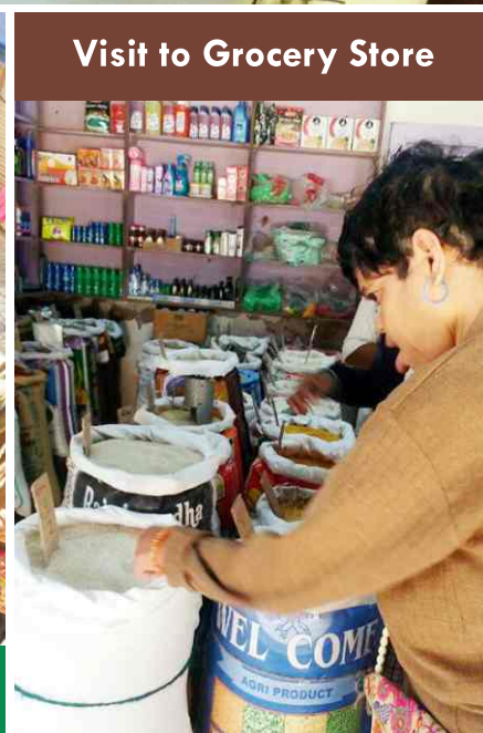
Visit to Grocery Store