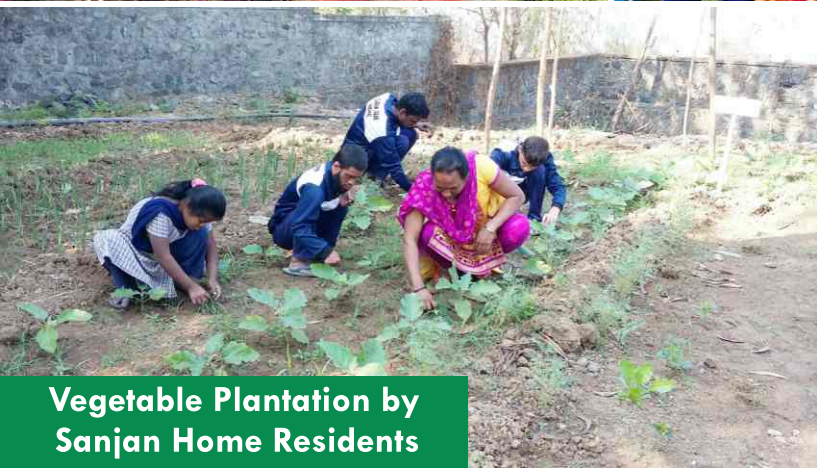
Vegetable Plantation by Sanjan Home Residents