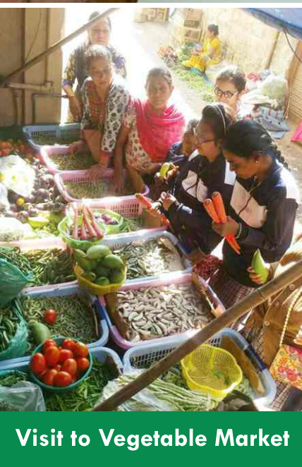
Visit to Vegetable Market