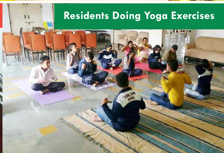
Residents Doing Yoga Exercises