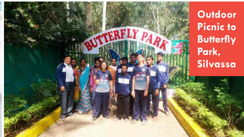
Outdoor Picnic to Butterfly Park, Silvassa