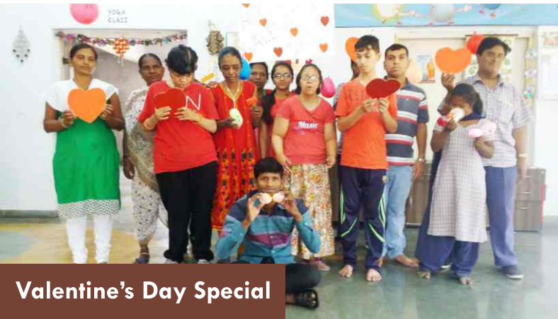
Valentine's Day Special