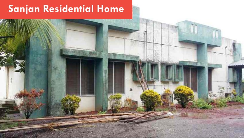
Sanjan Residential Home