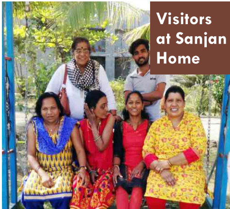
Visitors at Sanjan Home